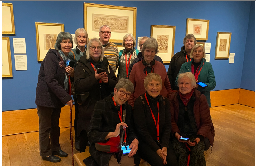
Art Appreciation at King's Gallery to view Italian Renaissance items.